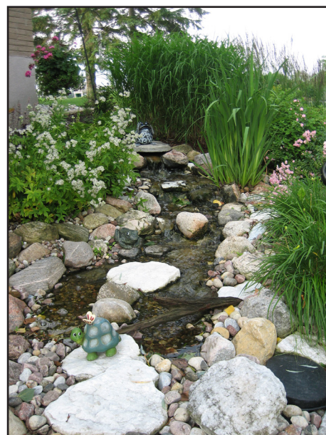
Water feature in Lorraine Jeffrey's backyard.

Why not take advantage of this quiet time in February to browse through your digital photo collection and select a great shot or two to submit!