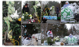
"DECK THE HALLS WITH BOUGHS OF HOLLY"