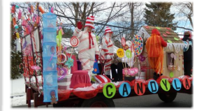
"TROLL THE ANCIENT YULETIDE CAROL"