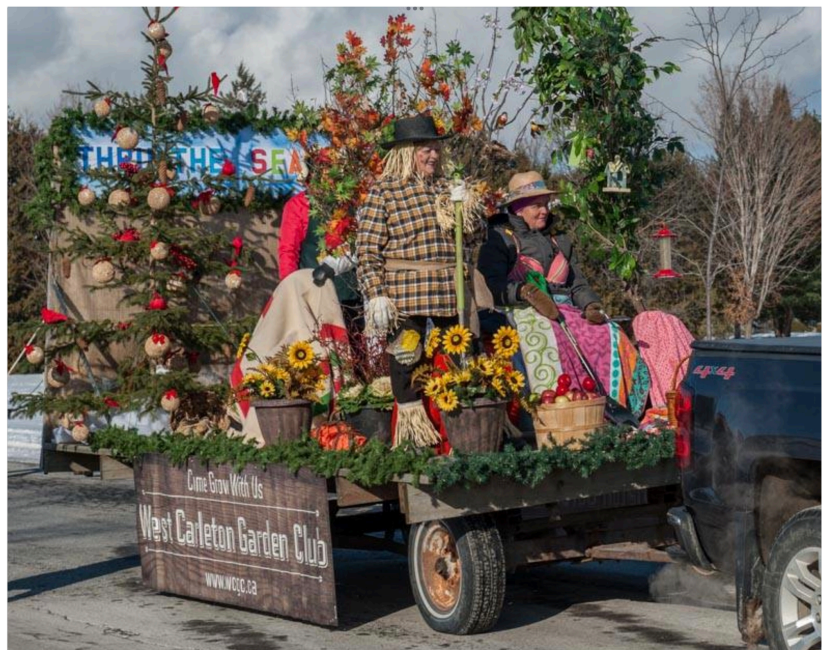
A Blast from the past: Carp Christmas Parade, December 2016