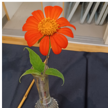
First place winning entries in the "Good Gourd" category (top), and the "Challenge Plant" category, Tithonia diversifolia (bottom)