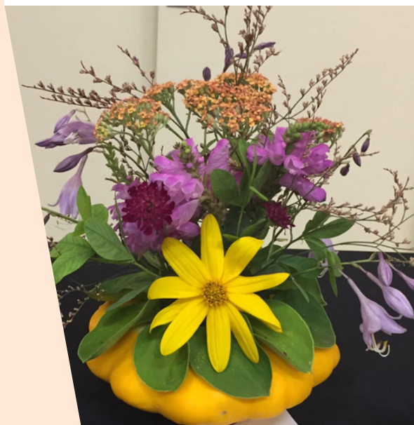
"Good Gourd," an entry to September 2022's Flower Show.