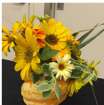
Entries from 2022's September Flower Show. Theme: "Friends Across the Fence."