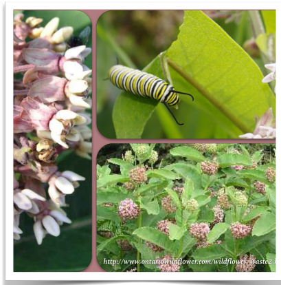
(Pic p.1 and text: J.Cutts)

To date they have formally been instrumental in the creation of 10+ school gardens and 10+ community gardens in the area, as well as having trained hundreds of teachers. They now present to Horticultural groups, Retirement Homes, and other Community Interest Groups.