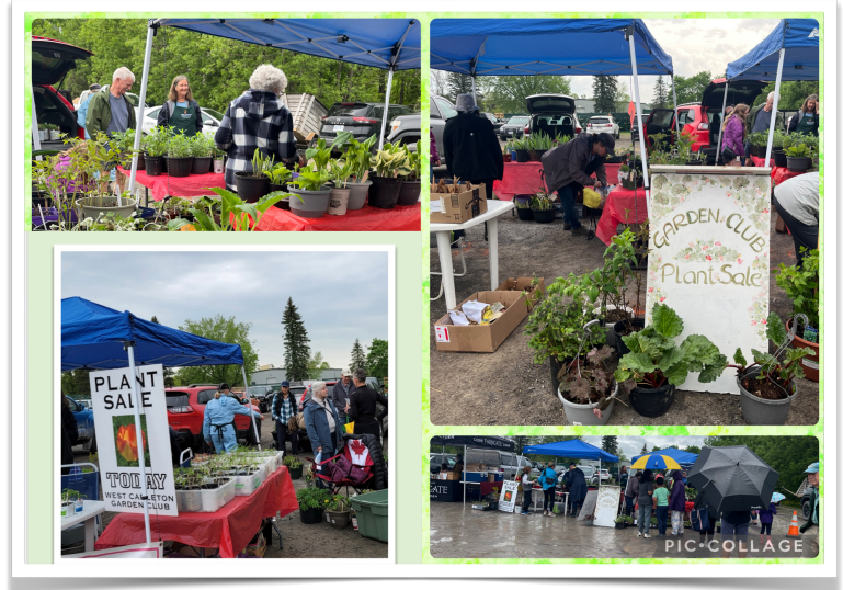
(Previous Plant Sales above)

Save the date: Saturday, May 16, 2026 "Annual Plant Sale" Carp Farmers' Market